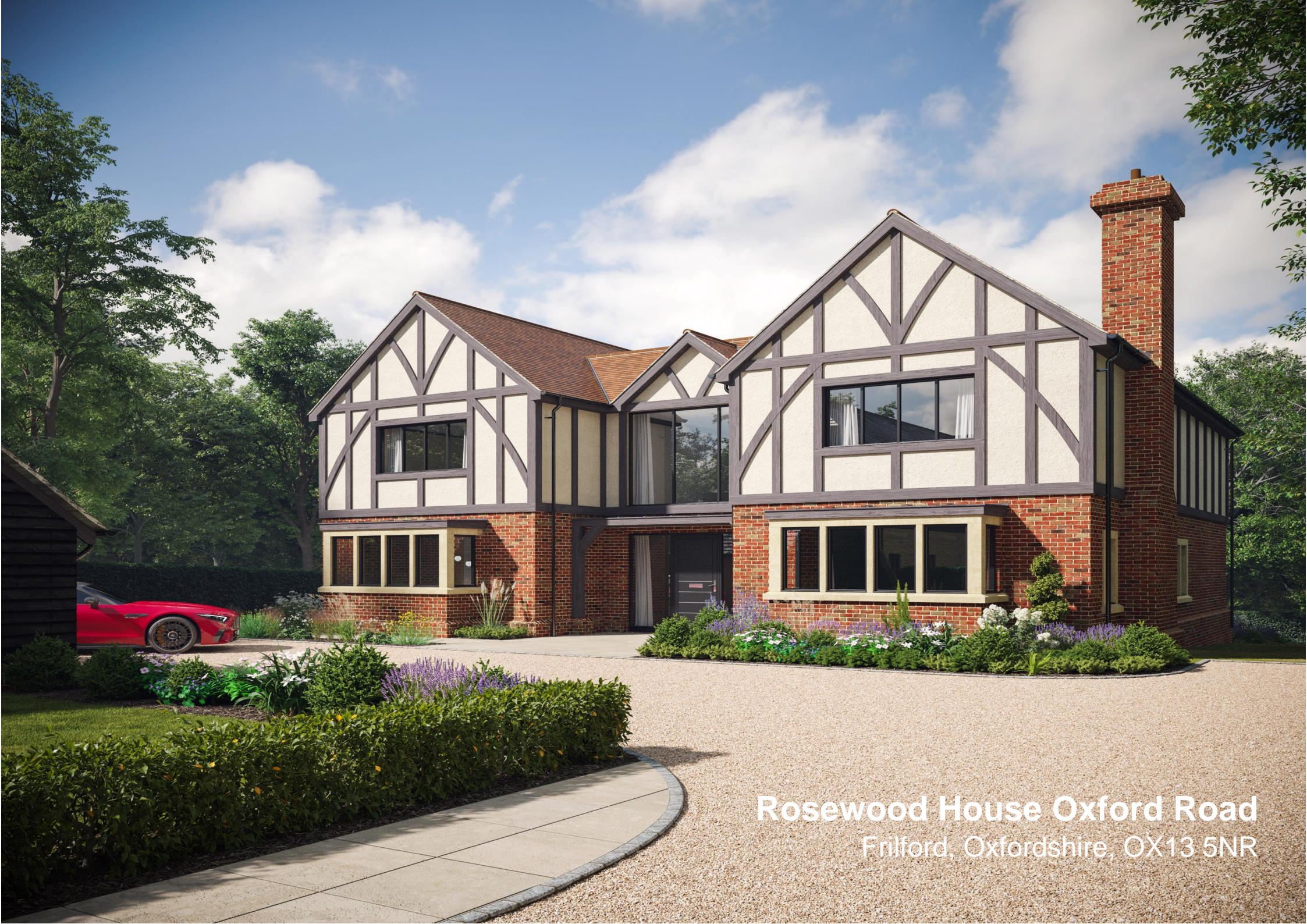
Rosewood House Oxford Road Frilford, Oxfordshire, OX13 5NR